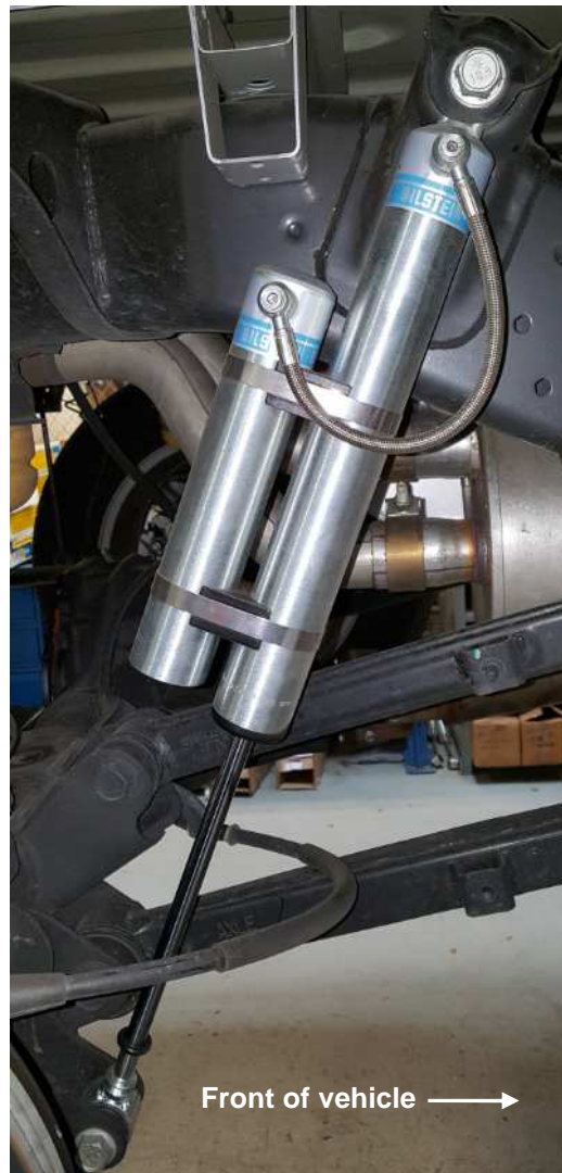
Figure 1. passenger side